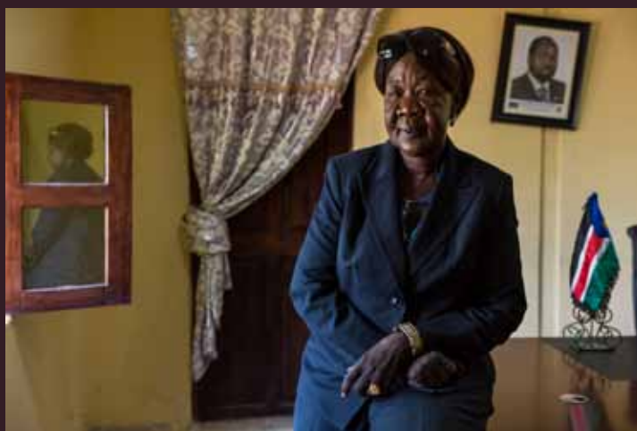
Below: The Hon. Rachel Anok Omot Obal, Jonglei State's minister of Gender, Child, and Social Welfare, is a vocal opponent of early marriage. She is working to create new schools and dormitories to broaden opportunities for girls to obtain education. Bor, Jonglei State, February 2013.