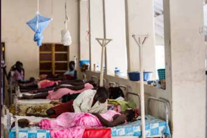
Above: The maternity ward in Bor Hospital. South Sudanese women face the highest maternal mortality rate in the world—estimated at 2,054 deaths per 100,000 live births. Bor, Jonglei State, February 2013.