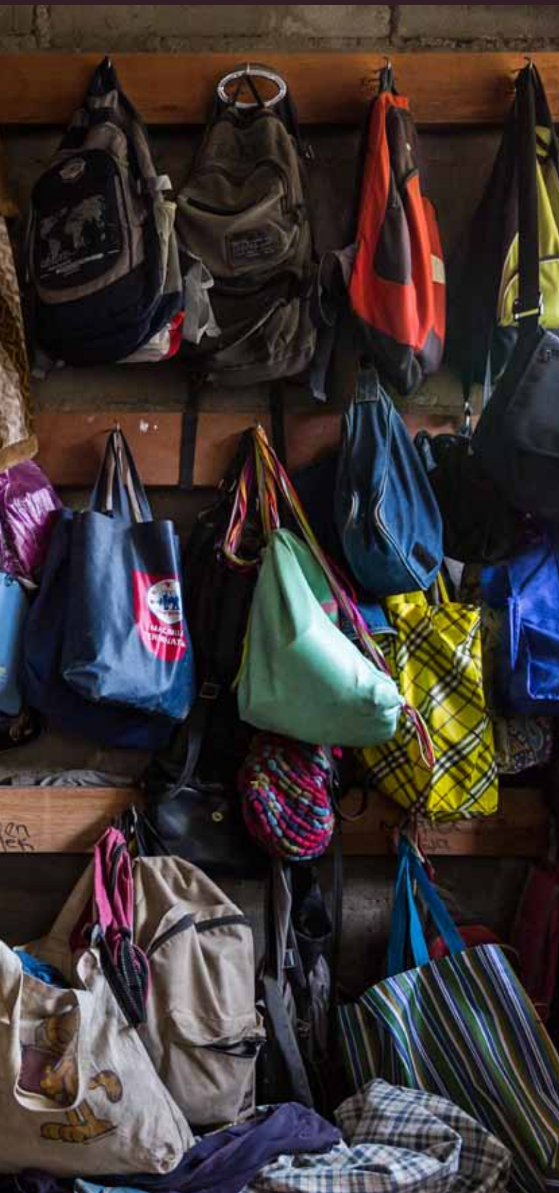
Backpacks hang on the wall of a nongovernmental organization that serves as an ad-hoc shelter for girls fleeing forced marriage. South Sudan has no shelters designed to assist survivors of gender-based violence. Lack of shelters or safe spaces where girls can seek help and protection when at risk of forced marriage—or when they run away from them—is a key barrier to effectively responding to forced marriages and domestic violence generally. Juba, Central Equatoria State, February 2013.